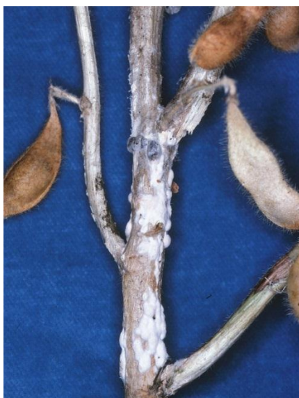
Figure 1: Sclerotinia stem rot caused by S. sclerotiorum .

There is no host specialisation in either S. sclerotiorum or S. minor , meaning that an individual isolate can attack any known host.