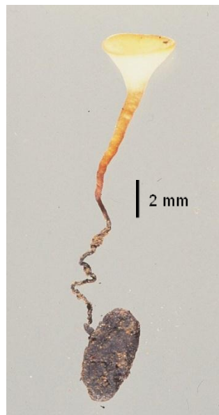
Figure 4: Germinated sclerote of S. sclerotiorum with a single cup-shaped apothecium at the end of a stalk.

Under a dense soybean canopy, sclerotes of S. sclerotiorum on or just below the soil surface germinate to produce a cup-shaped fruiting body (apothecium) which is 2-4 mm wide. Sac-like structures called asci develop on the upper surface of apothecia and spores inside the asci are forcibly ejected in response to slight changes in relative humidity in the crop canopy.