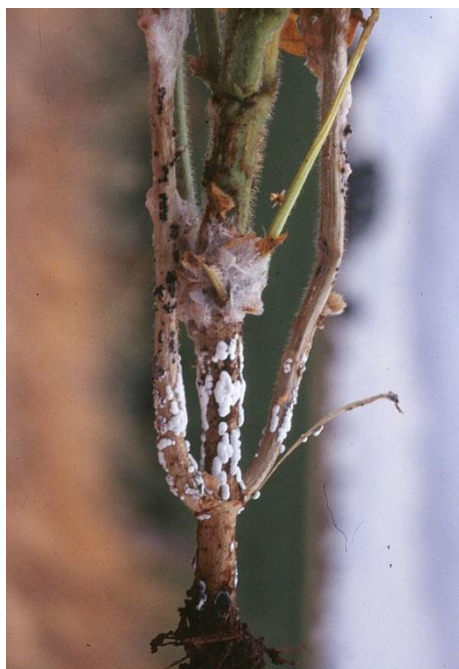
Figure 3: Sclerotinia base rot caused by S. sclerotiorum .

During mild, wet weather, the sclerotes of both species germinate and those near soybean plants produce fungal strands (hyphae) which can grow a short distance and invade the bases of plants, ultimately causing sclerotinia base rot. This mode of infection is far more common for S. minor than for S. sclerotiorum .