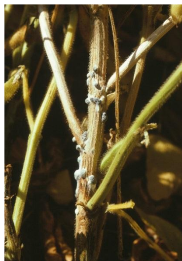
Figure 5: Black Sclerotes of S. sclerotiorum on a stem lesion.

Lesions develop at nodes where the dead flower petals and leaves have lodged between the stem and leaf petioles. Healthy plants can become infected from contact with lesions on adjacent Sclerotinia -infected plants.