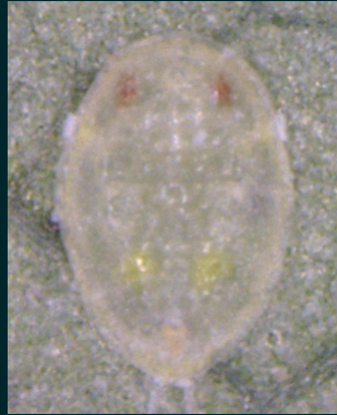
Red eye nymph development (the white wing buds appear just before emergence)