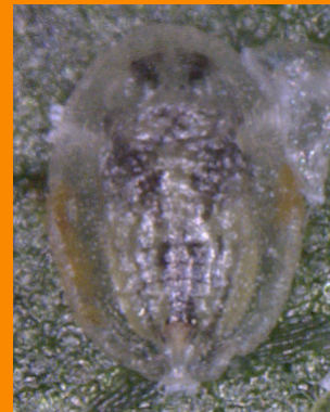
Examples of parasitoid pupae (colours may vary)