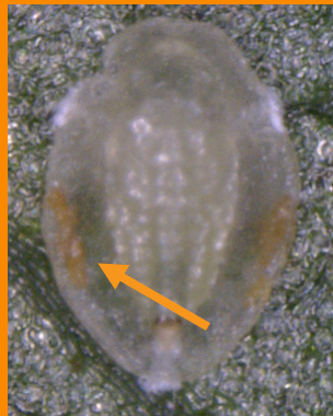
Red faecal waste