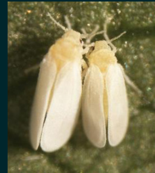
Empty pupal case (pushed open) and adult SLW