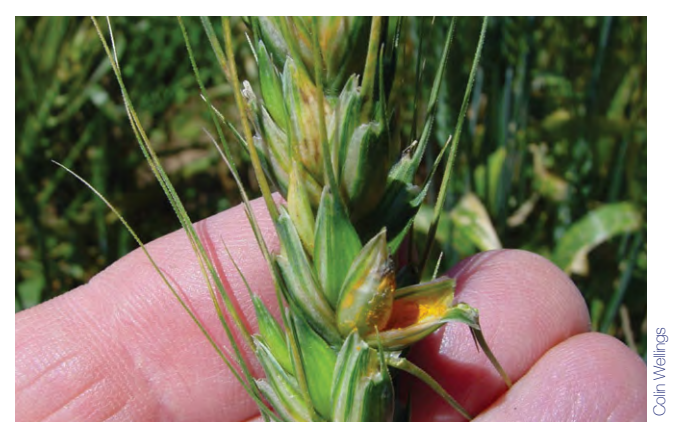
Stripe rust can also show symptoms on spikes, as demonstrated by this Wheat stripe rust infection