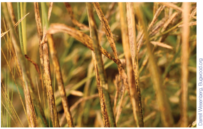
Advanced symptoms present on barley leaf sheaths