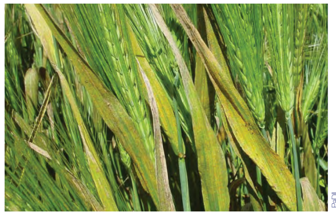
Leaves take on a yellow colour under high levels of infection