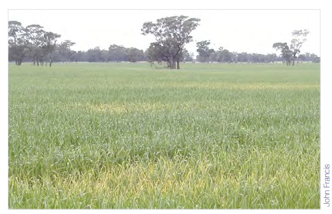
Stripe rust symptoms can develop as 'hot spots' in the crop