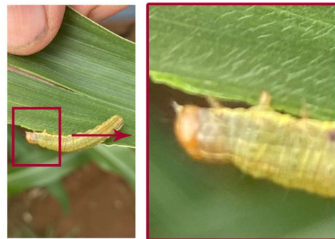
Pictures that are out of focus or grainy when zoomed are not suitable

Photographs submitted for insect identification must clearly show the features used to distinguish between species. A set of the following images/orientations is the bare minimum required for identification from photographs: